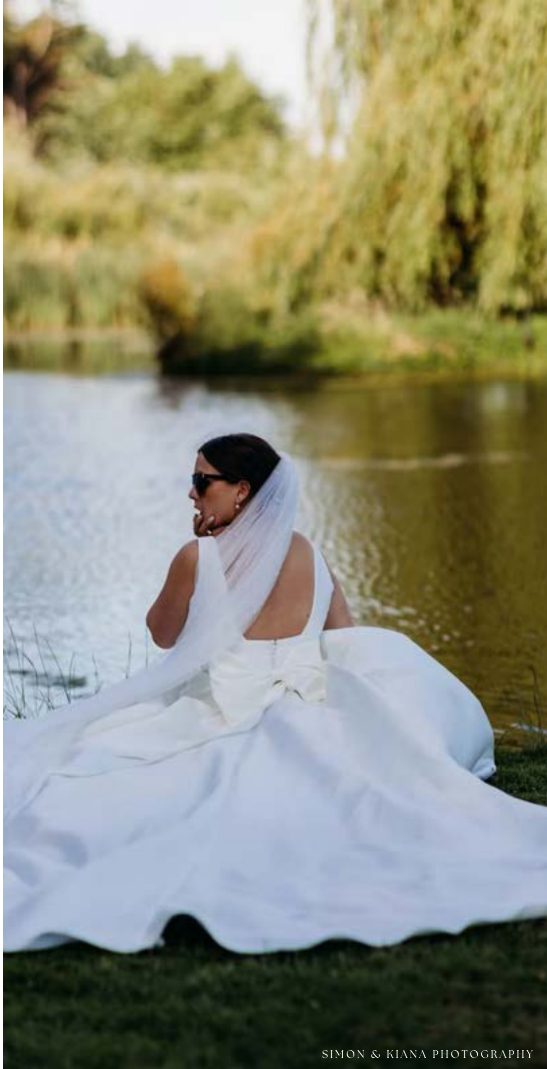
SIMON & KIANA PHOTOGRAPHY